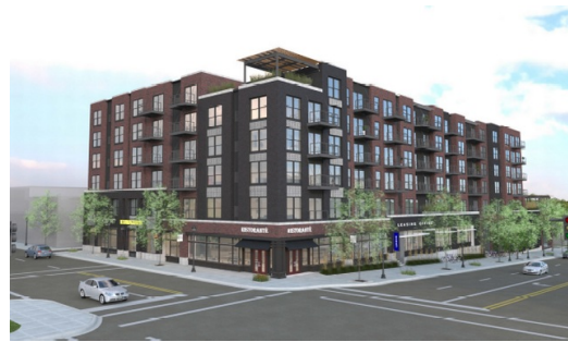
Opus Development in Westport