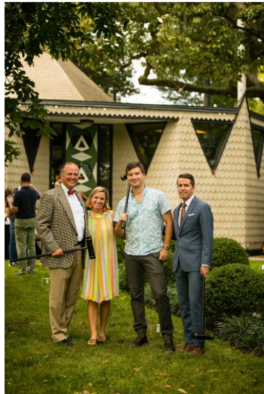
Croquet at the Nicol House

Check out the pictures from the event HERE and the video from the event HERE .